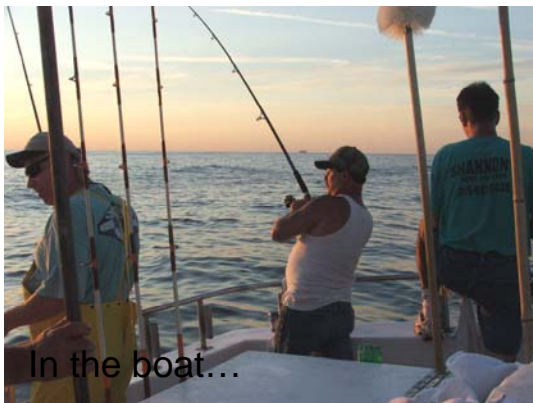
In the boat...