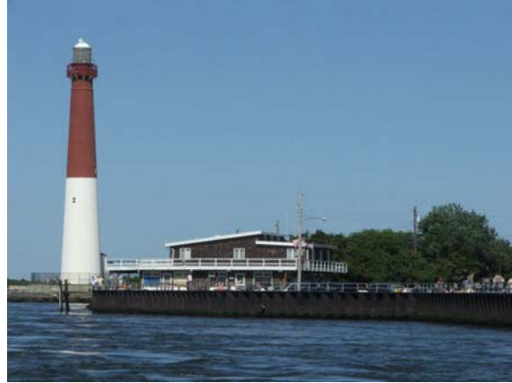
Preparing the rigs...